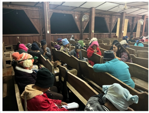
Praying with the ladies