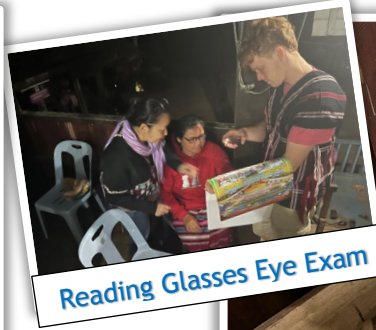
Reading Glasses Eye Exam