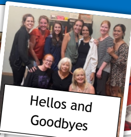
Hellos and Goodbyes