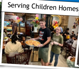
Serving Children Homes