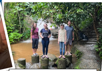
Exploring Chiang Mai