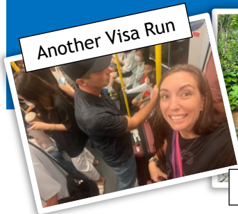
Another Visa Run